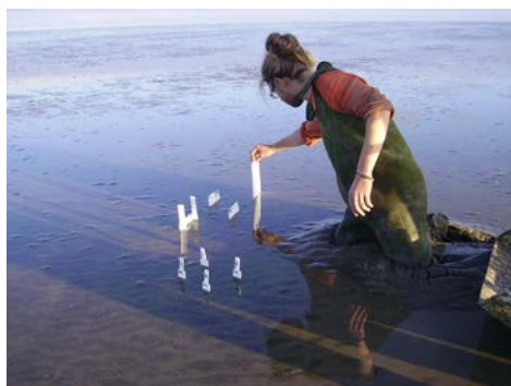
Fig. 2 : Gel probes deployment in the Brillantes mudflat of the Loire estuary

In the Loire estuary, hydrology governs sedimentation rates and salinity in mudflats. These parameters in turn influence meiofaunal ecology and dynamics. Such dynamics is not often studied despite its importance for proxy and/or bioindication development.